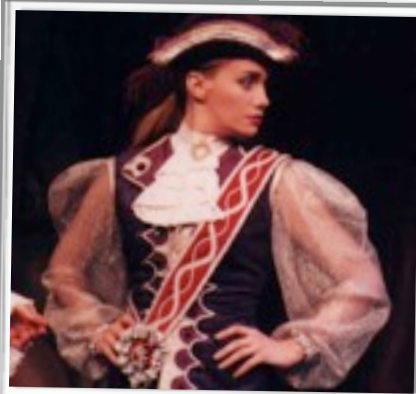
THE PRINCIPAL BOY!